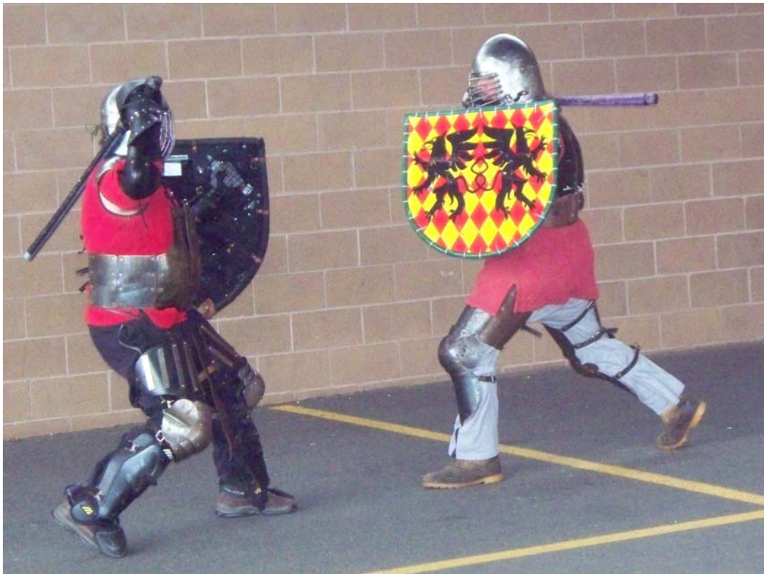
Sunday fighter practice is ON!